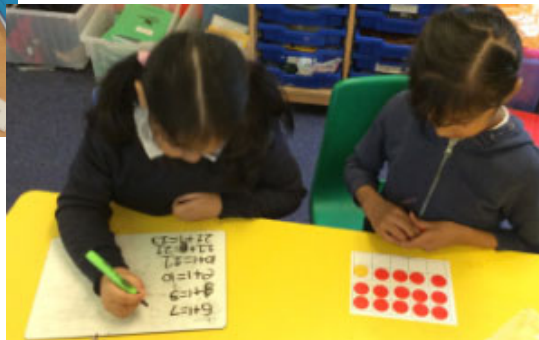
More and less in Maths