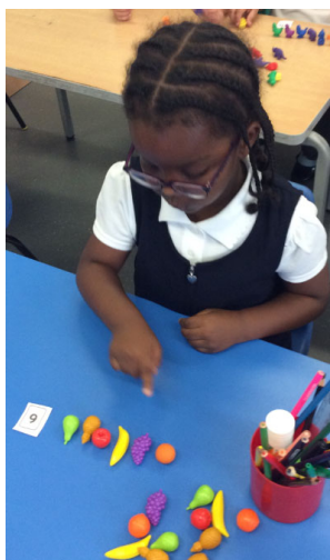
Counting in Maths