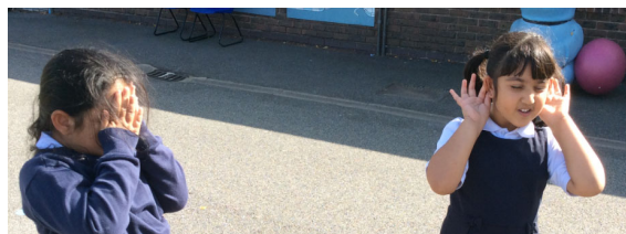
Using our senses in Science