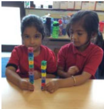
Comparing greater than and less than in Maths