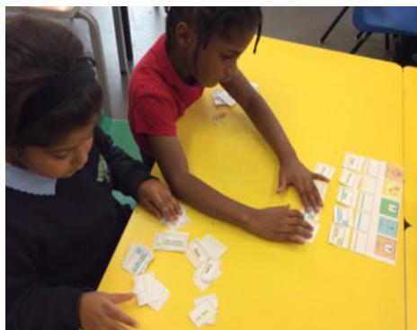
Creating sentences using colourful semantics in English