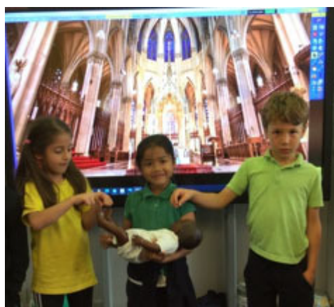
Learning about the Christian baptism ceremony in RE